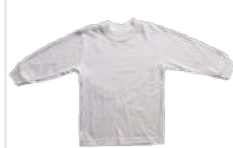
Unisex White Under Shirt (optional)