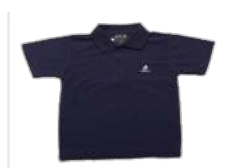
Unisex Navy Polo with Logo

Important: Please label all personal belongings. Order forms for naming labels are available through the uniform shop and front office reception desk. Naming should be done with indelible ink – full names only (no initials please) or using iron-on, sew-on or stick on labels.