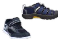
Sandals or Joggers (velcro)