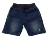
Unisex Stretch Denim Shorts with logo