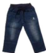
Unisex Stretch Denim Jeans with logo