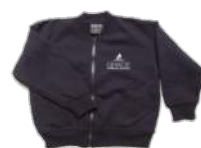
Unisex Track Top with Logo