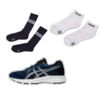
Girls Socks/Navv Boys Socks Joggers