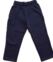
Navy Track Pants