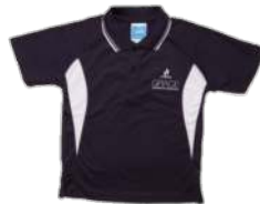
Navy Sport Polo

Monday 8.15 - 9.00am Wednesday 3.00 - 3.45pm Friday 8.15 - 9.00am