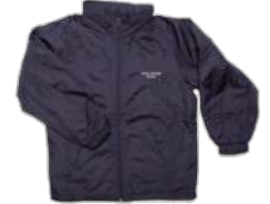
Navy Soft Shell Jacket