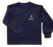
Navy Track Top