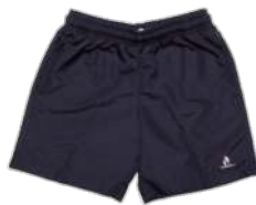
Navy Sports Short