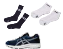
Girls Socks/Navv Boys Socks Joggers