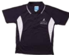
Navy Sport Polo

Monday 8.15 - 9.00am Wednesday 3.00 - 3.45pm Friday 8.15 - 9.00am