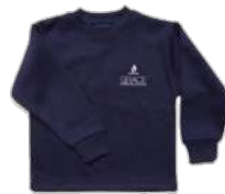
Navy Track Top