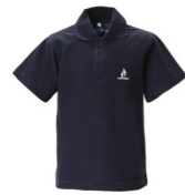
Unisex Navy Polo with Logo

All personal belongings must be clearly labelled with the child's full name, using indelible ink or iron on, sew on, or stick on labels. Initials are not recommended.