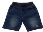
Grace Shorts with logo