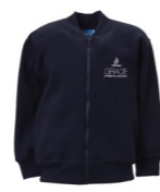
Unisex Track Top with Logo