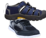
Sandals or Joggers (velcro)