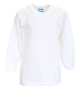
Unisex White Under Shirt (optional)