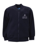
Unisex Track Top with Logo