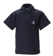
Unisex Navy Polo with Logo

All personal belongings must be clearly labelled with your child's full name, using indelible ink or iron on, sew on, or stick on labels. Initials are not recommended.