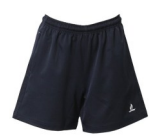
Grace Shorts with logo