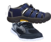
Sandals or Joggers (velcro)