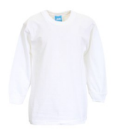
Unisex White Under Shirt (optional)