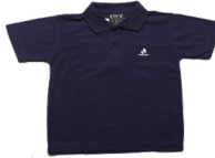
Unisex School Navy Polo

Important: Please label all personal belongings. Order forms for naming labels are available through the uniform shop and front office reception desk. Naming should be done with indelible ink – full names only (no initials please) or using iron-on, sew-on or stick on labels.