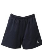
School Shorts with logo