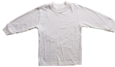
Unisex White Under Shirt (optional)