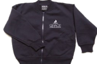
Unisex School Track Top